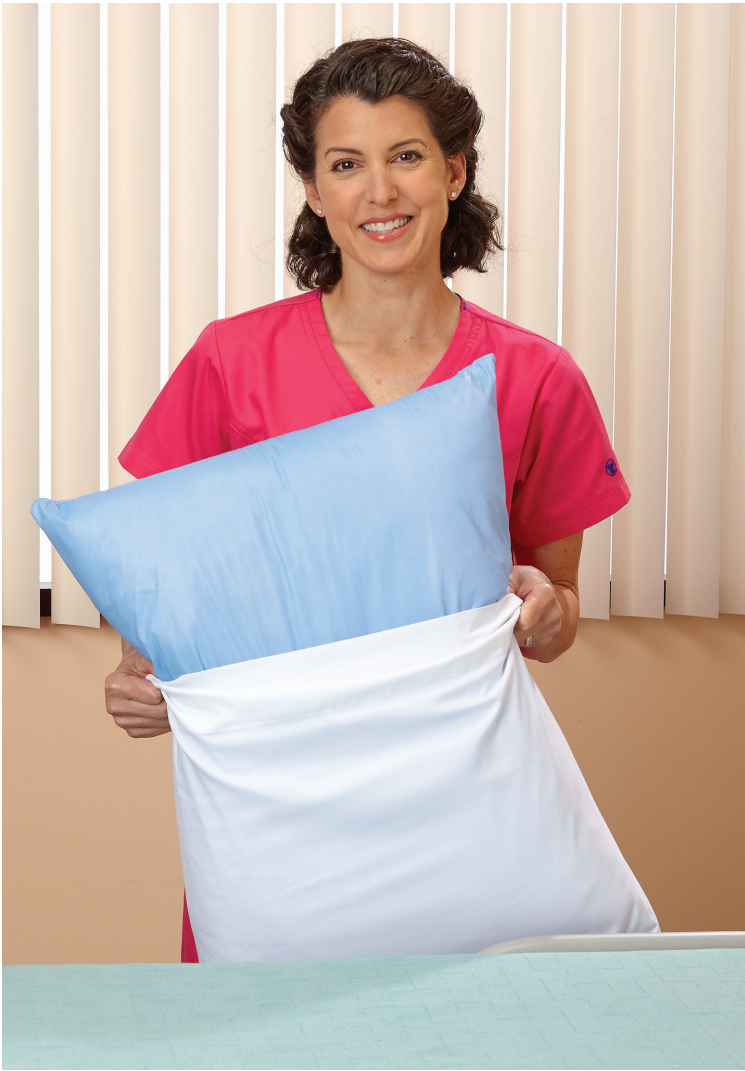
There is nothing more important to residents and their experience than the items that touch their bodies. Residents need just the right combination of the comforts of home and healthcare support.

We recognize that shipping turnaround and delivery lead times are important to you and your team. Our express service items provide the most ideal turnaround so that our products can be available for your residents when you need them.